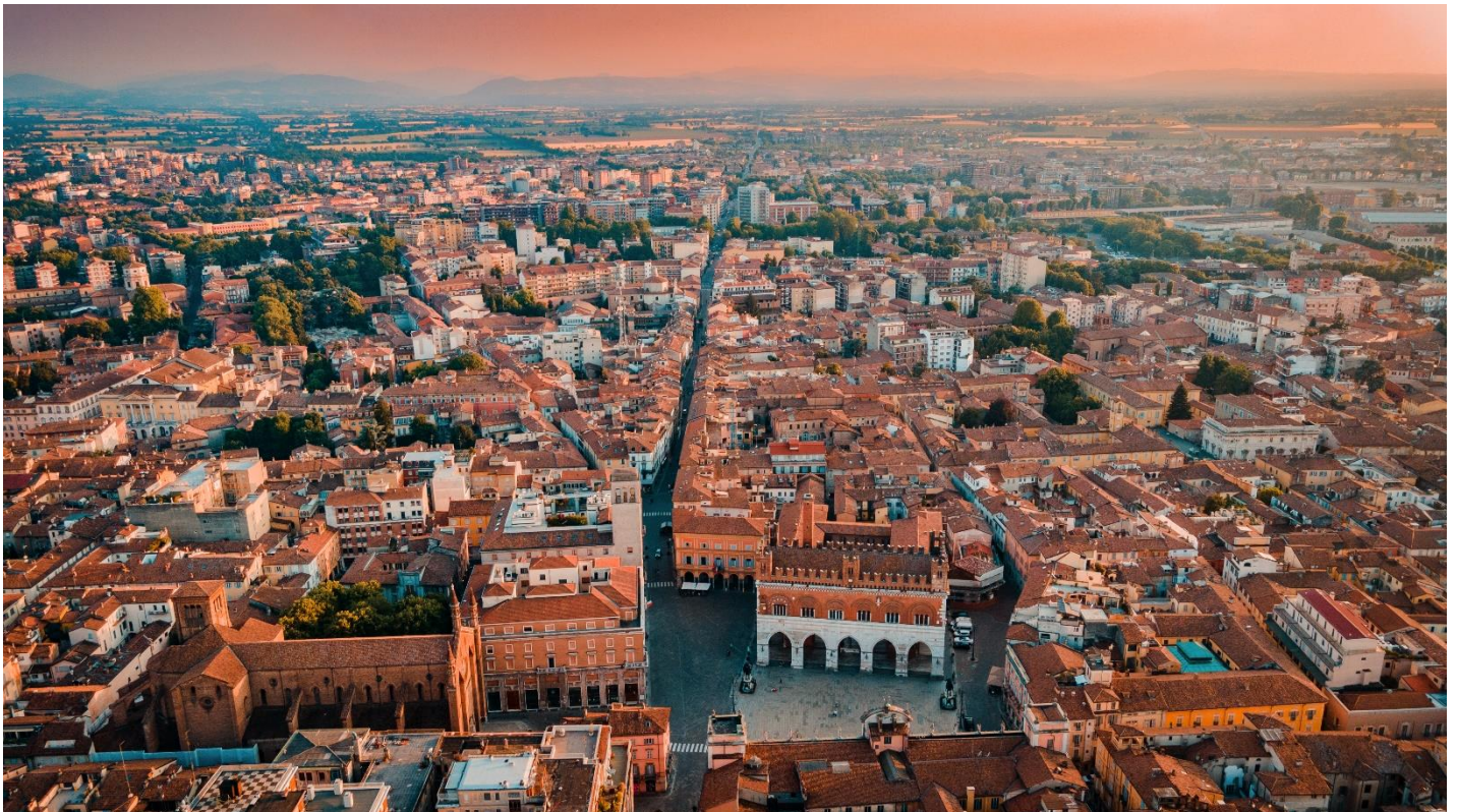
City of Piacenza