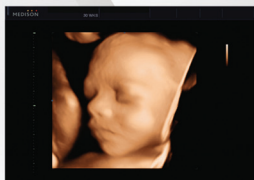
30 weeks fetal face with 3D DMR™