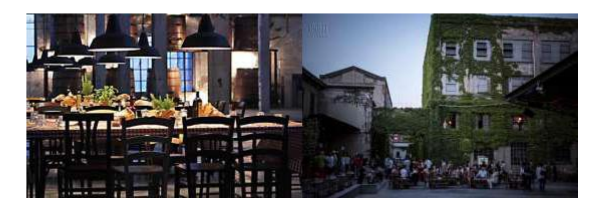
Spirit De Milan

Thursday evening, we had dinner at an old crystal glasswork fabric 'Cristallerie Livellara'. Nowadays this place, called 'Spirit de Milan', has become a dance floor, a theatre, a stage, a restaurant, a hangout and a new home for passions. In the bistro-restaurant you may find genuine and soothing homemade food, regional appetizers, chilled drinks and, most of all, good wine.