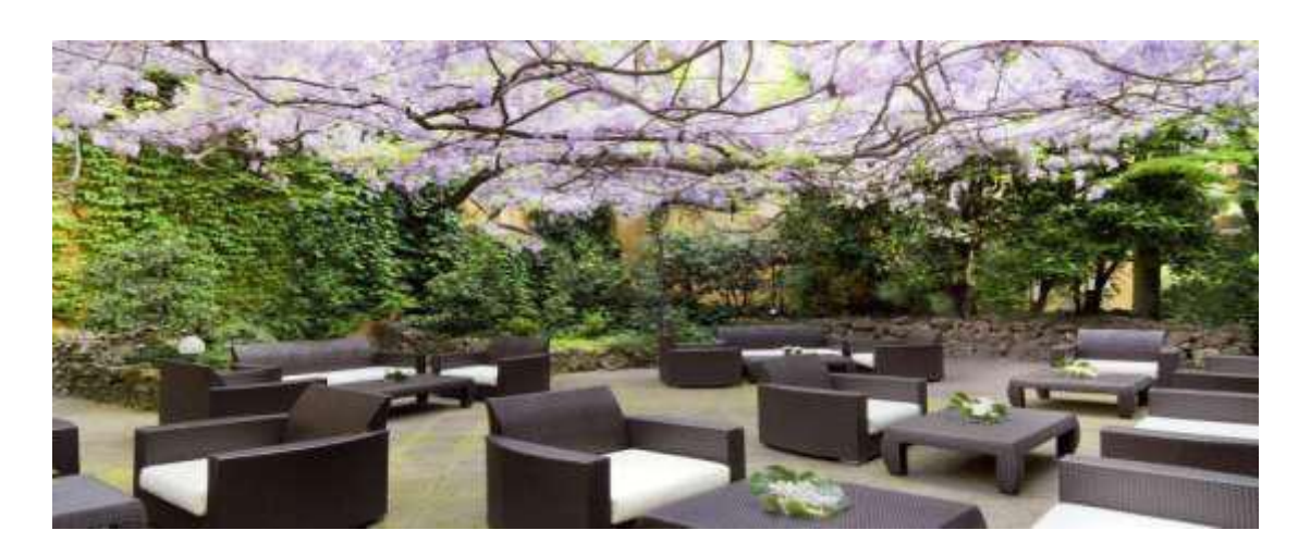
H Club Diana

On Tuesday we spent an evening at the H Club Diana, the place to be for an authentic Milanese aperitif in downtown Milan, located in a lovely green garden. A unique retreat in the center of Milan. The club is located in one of so-called "Milanese Movida" centers. Nearby are located Corso Buenos Aires, where large department stores and cheap clothing and shoe boutiques are, and Milan's Fashion District, where a large concentration of haute couture labels are.