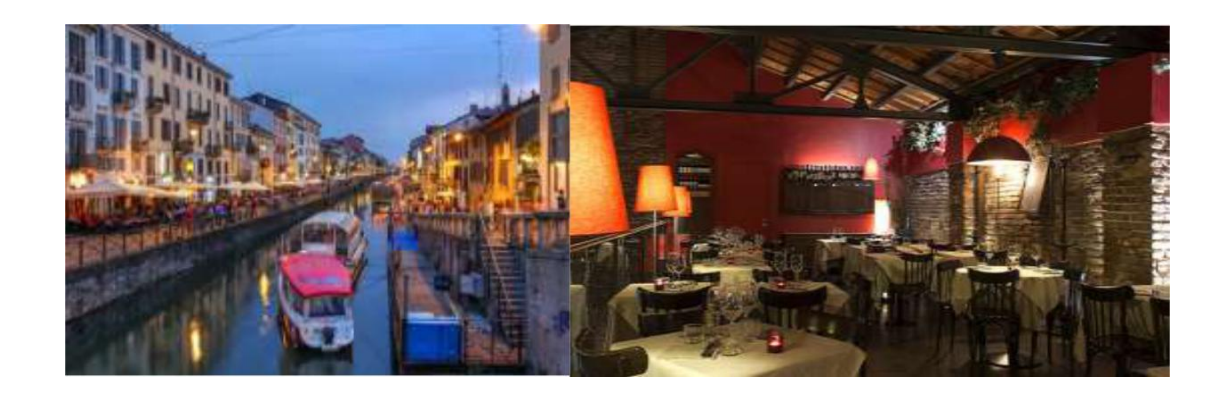
Navigli District and Officina 12

On Wednesday we had dinner at the restaurant Officina12 where the history of old Milan blends with an international contemporary touch. The cuisine is always in the pursuit of the highest quality and uses seasonal ingredients and local products. Officina12 is situated in the heart of the Navigli district, one of the most famous areas of Milan; charming and base of the Milan nightlife.