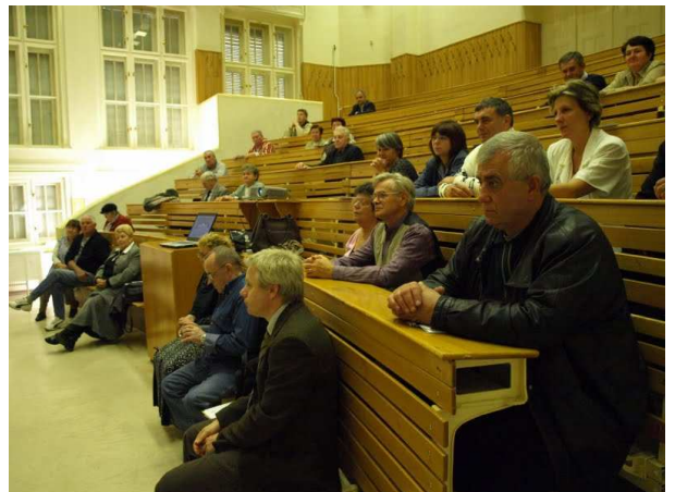
e) free communication with specialists and other patients