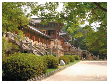
Majestic entrance to Bulguksa Temple

Many pre and post congress tours will be available to other parts of Korea, such as the famed Jeju Island, and neighboring countries like China. For detailed information about the tour program and to reserve a tour spot, please visit the Congress website at www.wcd2011.org .