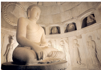
The main rotunda of the Seokguram Grotto