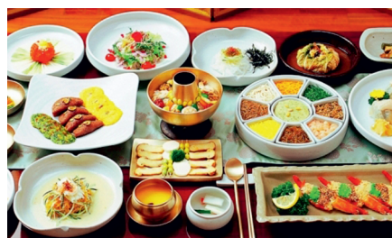
Traditional Korean cuisine served at the royal court of the Joseon Dynasty

Unique to the 2011 WCD, the KDA Seminars were introduced by the host Korean Dermatological Association with the intent to provide a greater variety and quantity of educational opportunities for those seeking to get the most out of the Congress. Six KDA Seminars will take place each morning from 7 to 8 am. Early morning shuttle bus service and light breakfast (coffee and pastries) will be provided for the seminars.