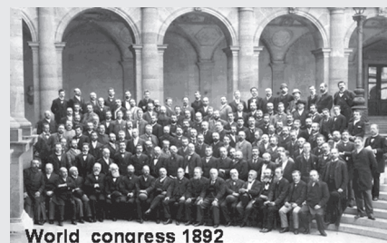
World congress 1892

The Austrian Society of Dermatology and Venereology (ASDV) has decided to consider to bid for the World Congress of Dermatology in 2015. Vienna is located in the heart of Europe. It has strong historical and, thus, cultural links to all its neighbour states and has been greatly influenced by them. This is also true for dermatology in that two of our country's giants, e.e. Hebra and Kaposi, came from