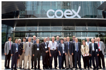
ILDS board in front of the 2011 congress center COEX