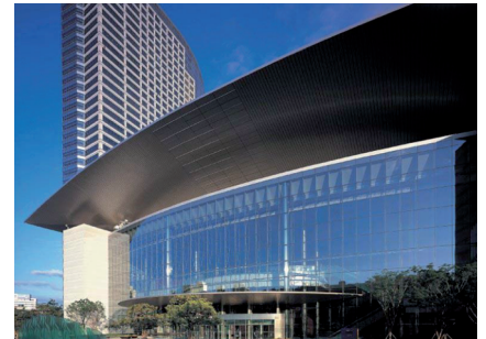
Front view of COEX, the main venue