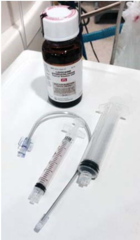
Figure 1. Malleable atomizer.

Topical application of 4% lidocaine was applied to the patient's oral cavity and oro-hypopharynx by either a syringe or an atomizer (MADgic Laryngo-Tracheal Mucosal Atomization Device [Teleflex]; Figure 1). Particular areas of interest for coverage were the posterior tongue, tonsillar pillars, and the supraglottic areas. If the patient's mental status allowed, they were requested to gargle as long as possible and then swallow the TLA liquid. A "cough" was anticipated as the TLA was sprayed and gargled. This suggested aspiration of the liquid and potential periglottic-tracheal coverage. Fewer than 5% were topicalized using a laryngo-tracheal analgesia device containing 4% lidocaine (4 mL). Additionally, lidocaine jelly/ointment was applied to the tongue with a tongue depressor or via the laryngoscope blade. The adequacy of topical anesthesia coverage was commonly